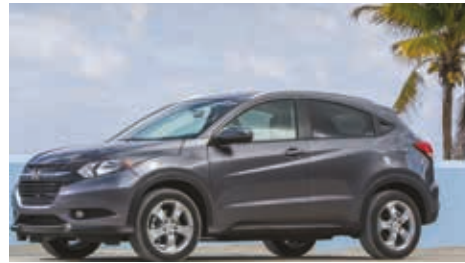
One of the Honda HR-V's advantages is its configurable rear seat, which gives it a distinctive ability to fit bulky or long cargo items inside.