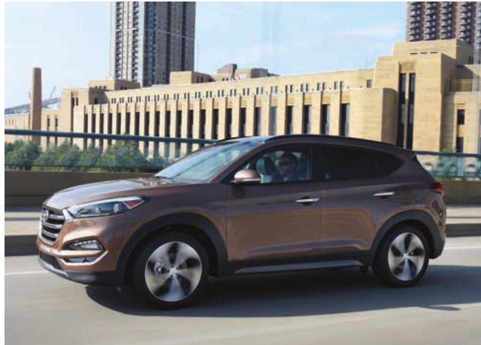
The all-new 2016 Hyundai Tucson delivers much in a tidy package that ranges from $22,700 to just north of $31K.