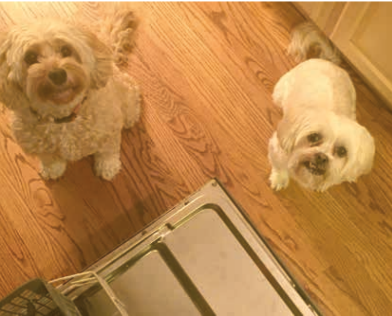
Just keeping the house safe