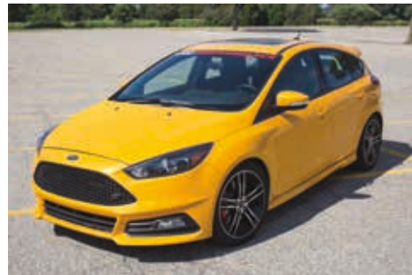
The new Focus ST benefits from all the technology and craftsmanship while adding fun-to-drive DNA to the "hot hatch" segment.