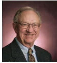
Mayor Scott Douglass