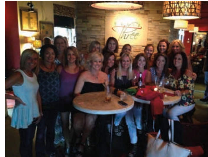
Some Clarkson Valley ladies out for dinner at Table Three.