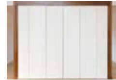
What's Behind Door #1?