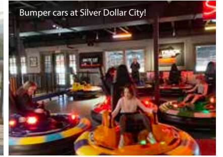
Bumper cars at Silver Dollar City!

and spin, an arcade, laser tag, a golf simulator and a bowling alley that looks like an aquarium.