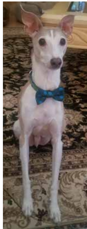
Don't you be talkin' 'bout my bowtie!