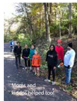
Moms and kiddos helped too!