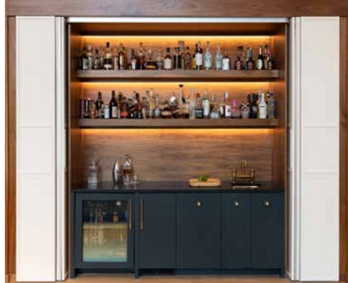
...No Holds Barred