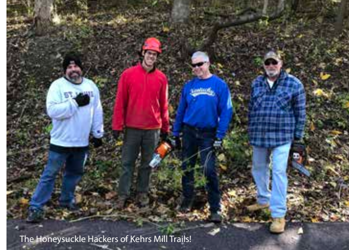
The Honeysuckle Hackers of Kehrs Mill Trails!

The “Honeysuckle Hackathon” was so successful that it will be done on a regular basis in Kehrs Mill Trails. Roadways in the subdivision are wider, lines of sight have been cleared and walkers feel safer.