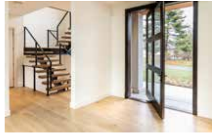
View from the Great Room of Open Staircase and Front Pivot Door