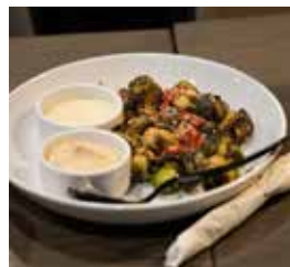
Flash Fried Brussel Sprouts with Lime Mayo & Spicy Aioli