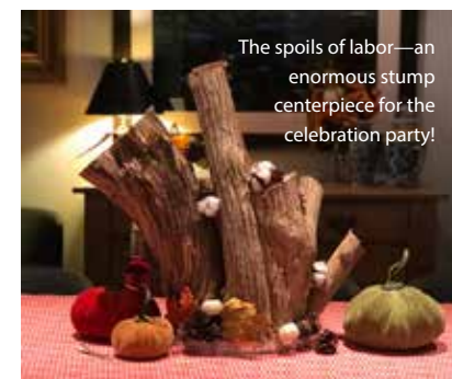
The spoils of labor—an enormous stump centerpiece for the celebration party!

One volunteer who has cleared his entire property of this pest remarked that he had spent his teenage years in the 80s in the neighborhood and often played in the woods. He stated that at