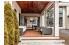
Entertainment Stage Left