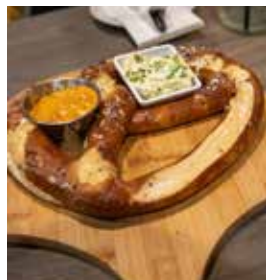
Everything Seasoned Pretzel with Scallion Cream Cheese Spread and Beer Cheese