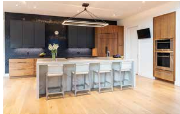
A Kitchen Built for Soirées