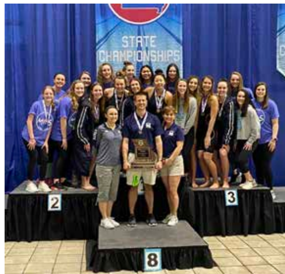
How about the amazing Marquette Girls Swim and Dive team—back-to-back state champs!