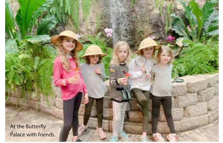
At the Butterfly Palace with friends.

Big Cedar is such a fun place to stay and has something to do for every member of the family. They offer mini golf, a playground, several pools, a lazy river, hot tubs, campfires, paddle boats, canoes, and more! They also have several restaurants including Top of the Rock which offers amazing views of Table Rock Lake. Fun Mountain (also open to the public) has activities for the entire family like bumper cars that go upside down