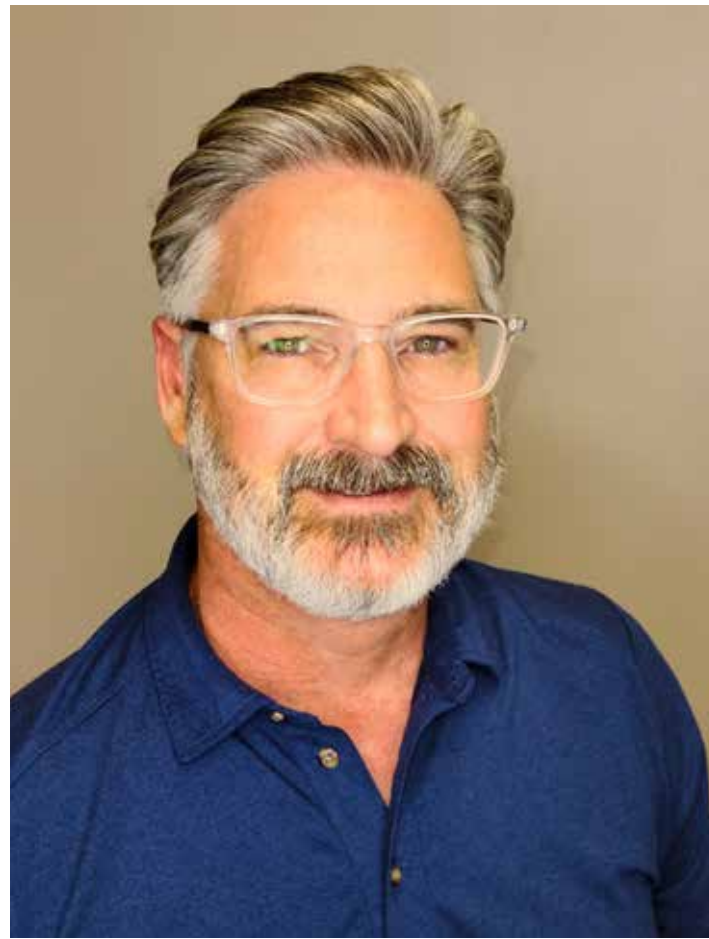
Looking better and feeling good after my grooming!

After we figure out what we're going to do, we head back to the sinks, and I get a shampoo, hot towel, and scalp massage. Wow! I am relaxed and ready for the cut. Kassy is very methodical, takes her