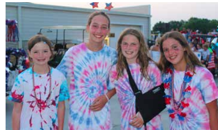
Celebrating the Fourth in matching tie-dye!