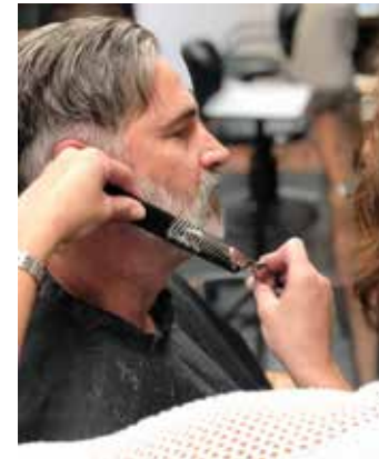
The process of maintaining well-groomed facial hair.