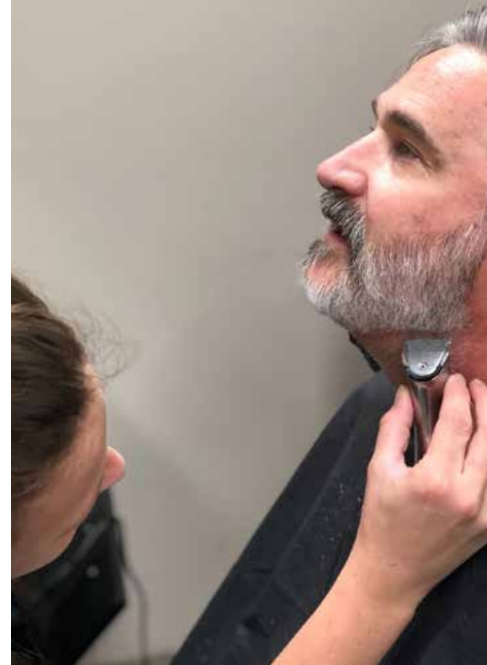
The details and finishing touches.

time, and never seems rushed. She definitely has a process, but I am usually only there for about an hour—including eyebrows, neckline trim, and beard grooming!