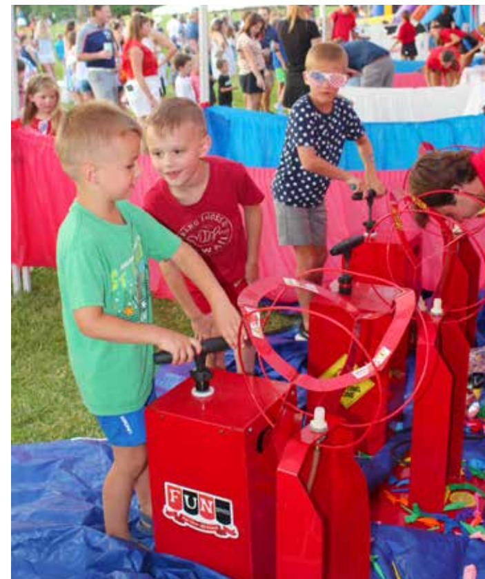
Trying their luck at the carnival games!