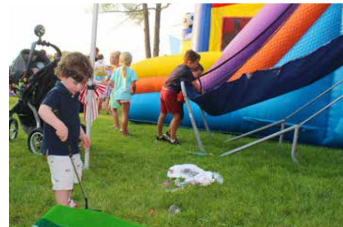
Never too young for golf!