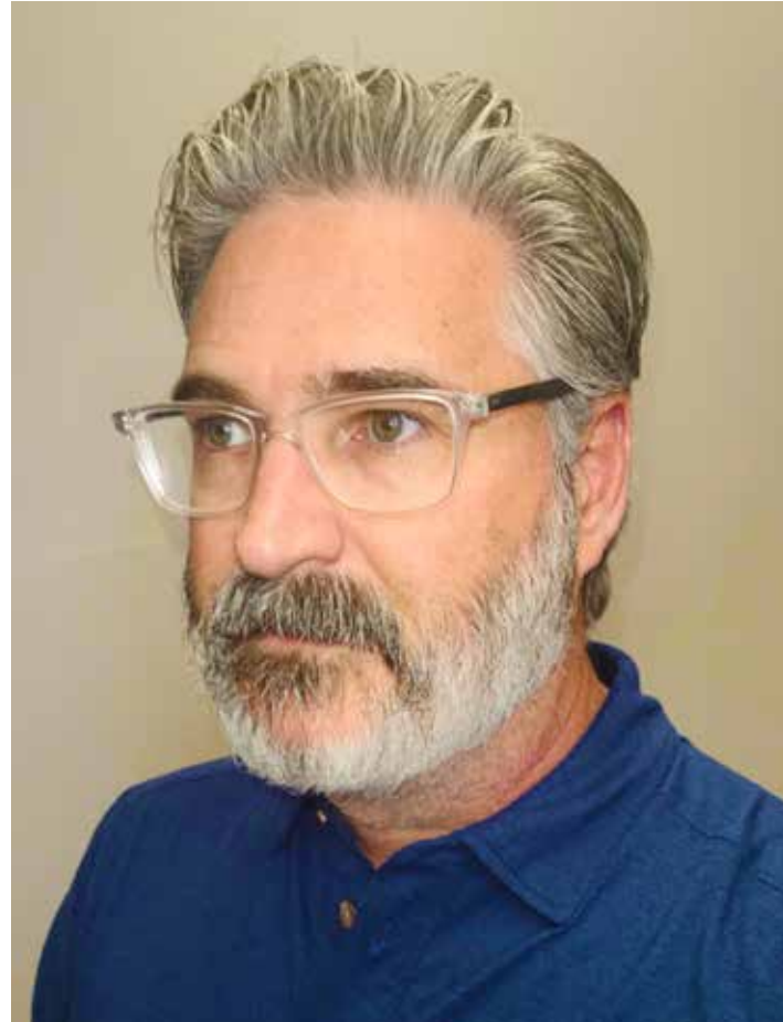
Looking a little shaggy before.