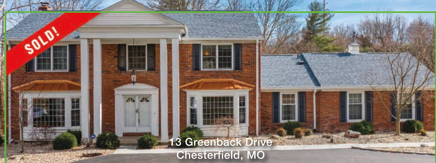
13 Greenback Drive Chesterfield, MO