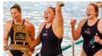
The Mustang girls celebrate their Missouri Water Polo district championship!

accomplished this year and could not have had a better group of girls for her senior season.