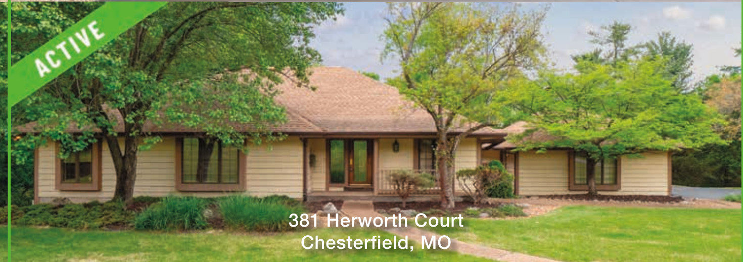
381 Herworth Court Chesterfield, MO