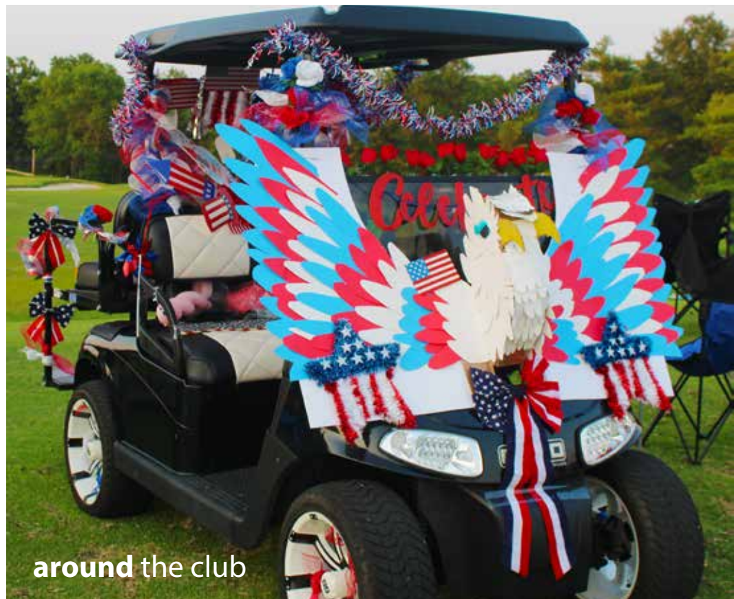
around the club