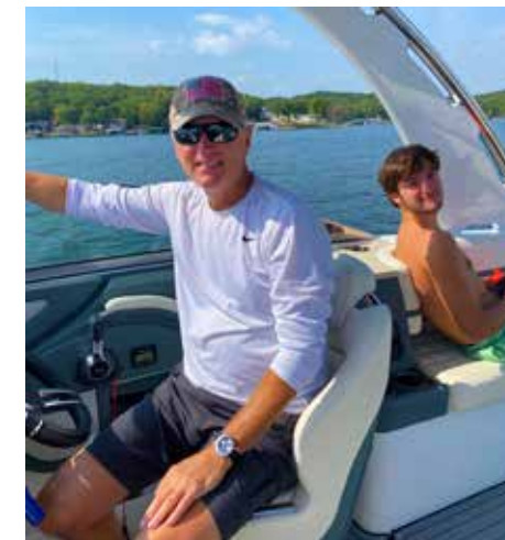
A relaxing day at the lake.