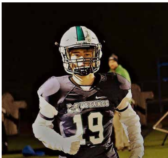
Austin in action with the Mustangs.

felt like a smaller school. The campus is easy to get around, and it feels very easy to manage. I felt very comfortable there knowing I could connect with my teachers personally.