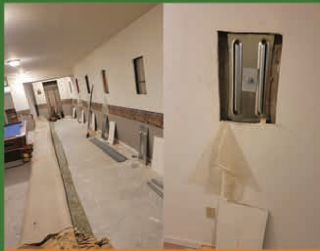
BOWED WALL REPAIR