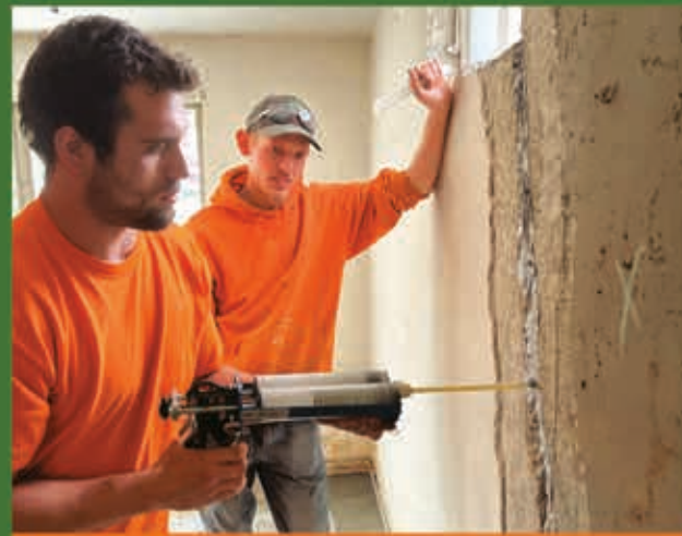
WALL CRACK REPAIR

Schedule a Free Inspection & Estimate Today: