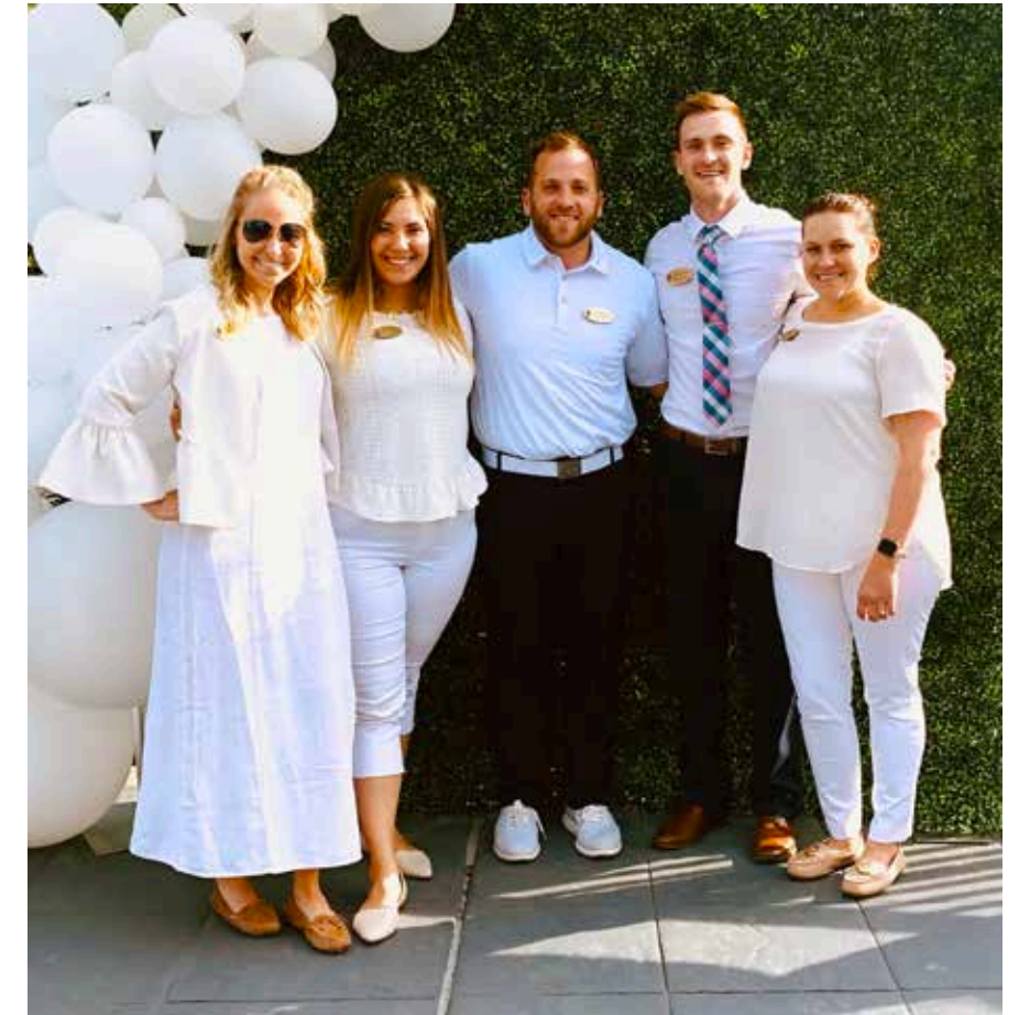
The Leadership Team at Forest Hills Country Club